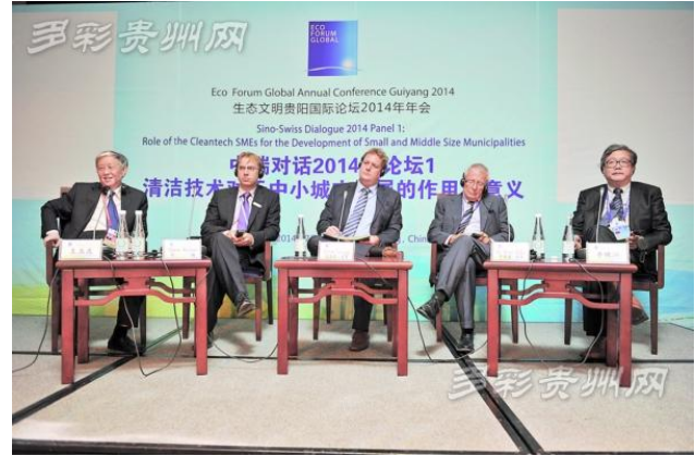
Fig. 12: Panel1 - Role of the Cleantech SMEs for the development of small & middle size municipalities