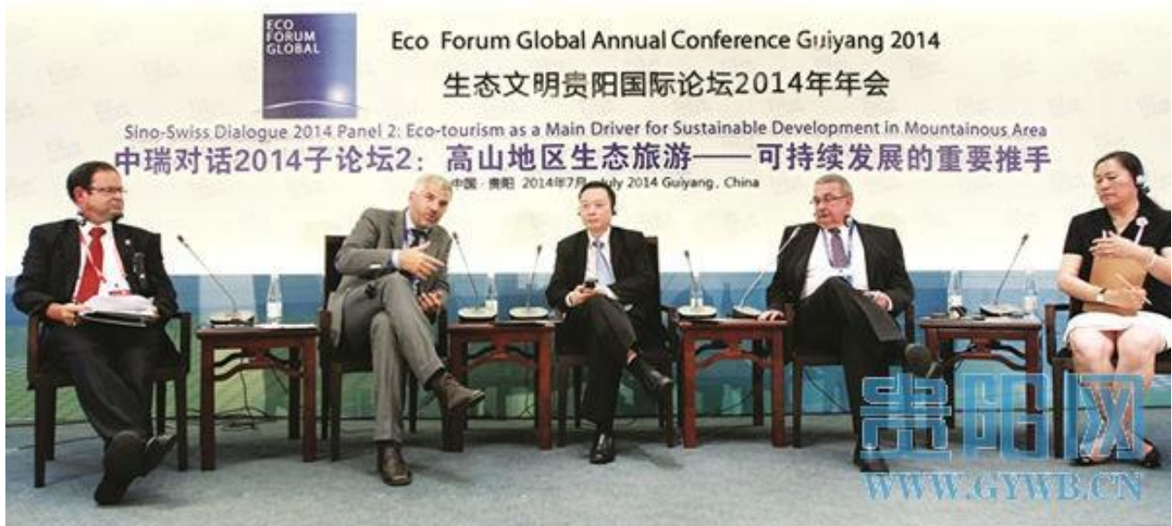
Fig. 13: Panel 2 - Eco-tourism as a main driver for sustainable development in mountainous area