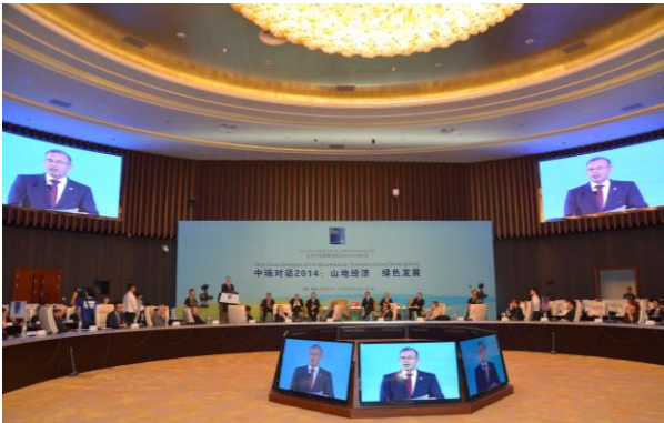
Fig. 9: Opening session of Sino-Swiss Dialogue 2014

At the closing session, a Sino-Swiss agreement - Mountain Economy and the Construction of Ecological Civilization Consensus on enhancing mountainous economy and green development is announced, which highlights the efforts and achievements in a more humanized and sustainable way of developments.