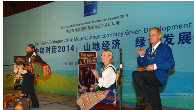
Fig. 10: Swiss folk music performance