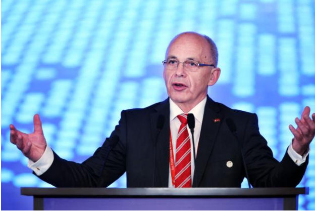
Fig. 3: 瑞士联邦主席毛雷尔致辞