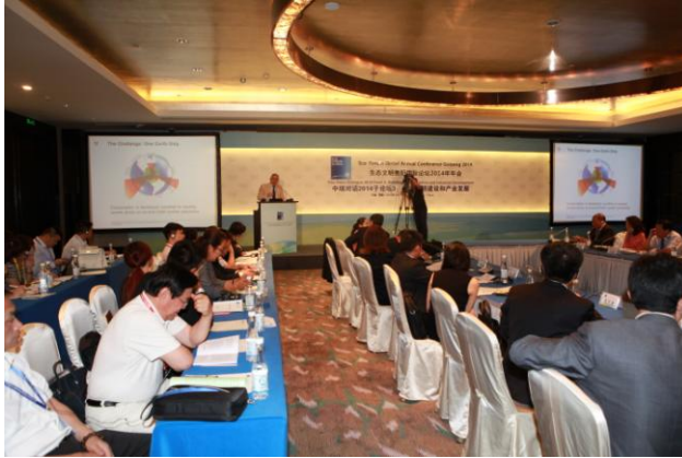
Fig. 14: Panel 3 - Building eco-civilization and industrial development