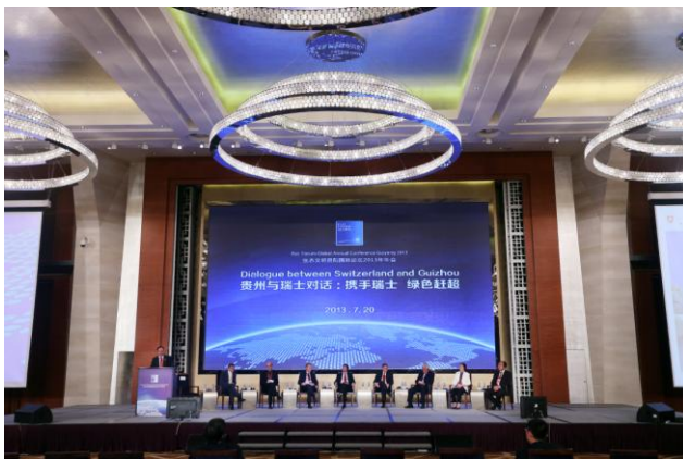
Fig. 1: Dialogue between Guizhou and Switzerland

There were three rounds of dialogue, and more than 10 specialists and entrepreneurs from Switzerland and China shared the experience of Switzerland and discussed the future path of Guizhou on “sustainable and balanced development needs core policy support”, “strategies for sustainable development in rural areas”, and “urban and rural areas realize harmonious co-prosperity”. Four experts in Zurich also presented in the discussion through live satellite connection, which made the event a spiritual and cultural feast across time and countries.