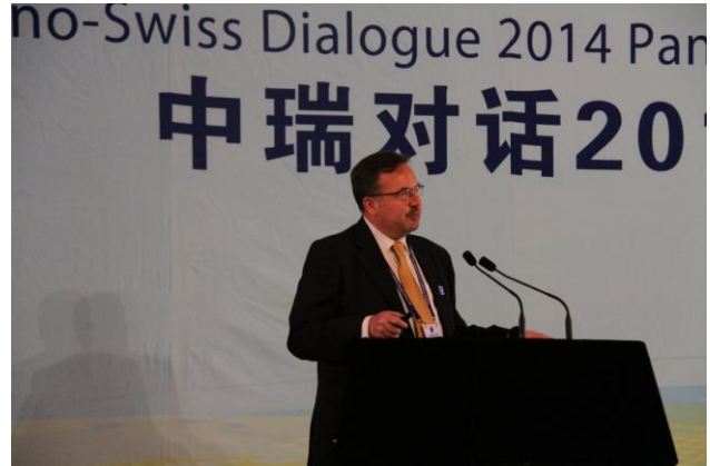
Fig. 15: Panel 4 - Potential and prospective cooperation for the FTA