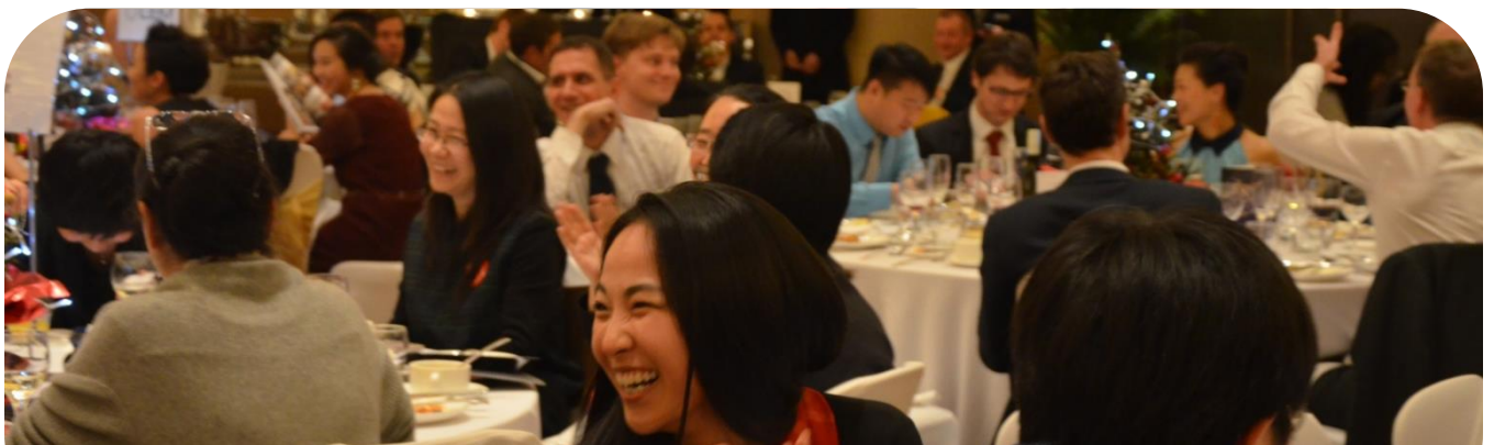
SWISSCHAM NIGHT – DECEMBER 2018