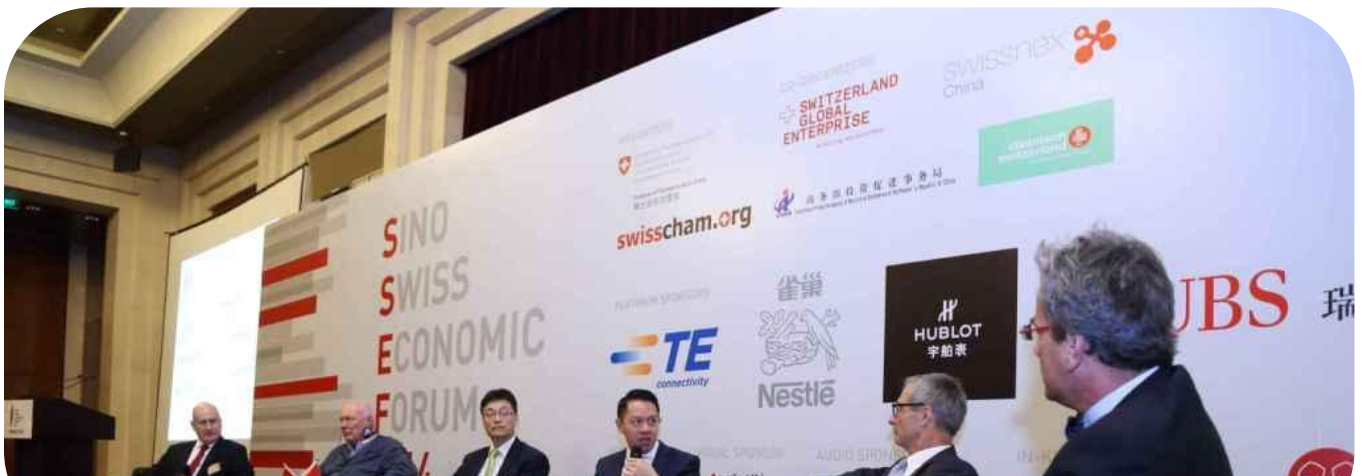
SINO-SWISS ECONOMIC FORUM – TO BE ANNOUNCED