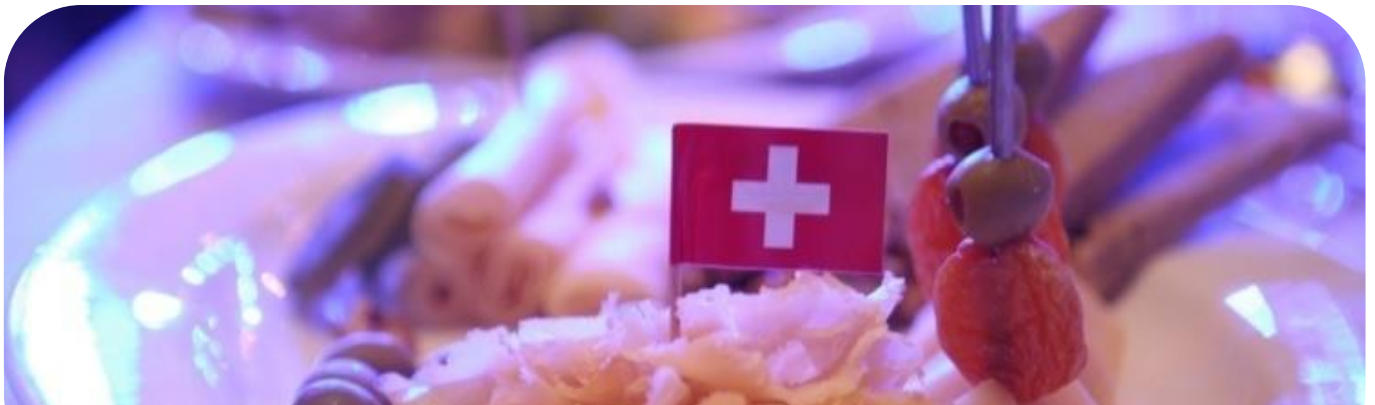
SWISS TRADITIONAL DINNER – 30 MARCH 2018